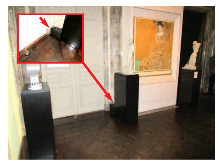
Figure 6. Enclosure (red arrow) constructed around vibration monitor in second-floor gallery.