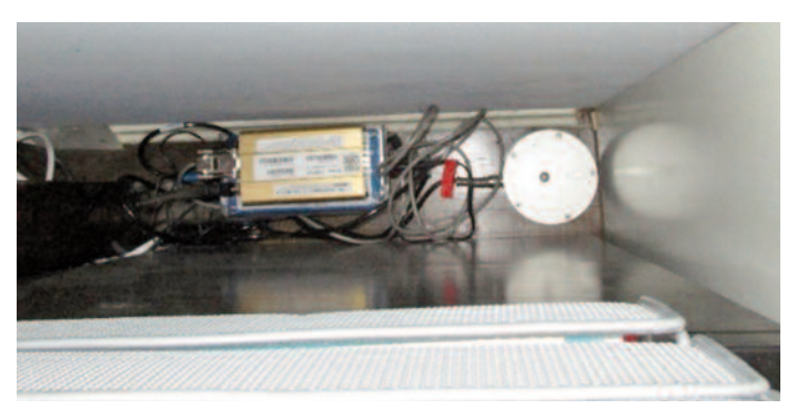
Figure 4. Looking down at typical vibration monitor installation.

floor, one on the third floor, and one on the second floor near the installed art (see Figure 6). The monitoring system was networked, remotely accessible in real time, and programmed to provide immediate notifications of any above-limit measurements. Two alert levels were utilized: a lower level of 0.075 in/sec PPV to serve as a caution to