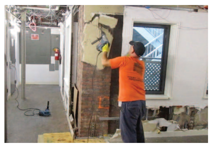
Figure 5. Dropping terracotta blocks with plaster finish from a height during vibration trials.