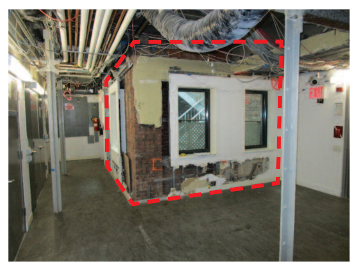
Figure 3. Interior view of load-bearing masonry walls to be removed on fifth floor.